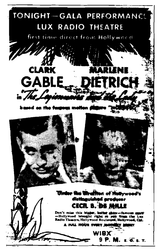
6/1/36 Utica Observer-Dispatch